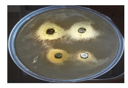
Figure(4):Effect of methanolic extraction of Chammomilla against .Bacilli