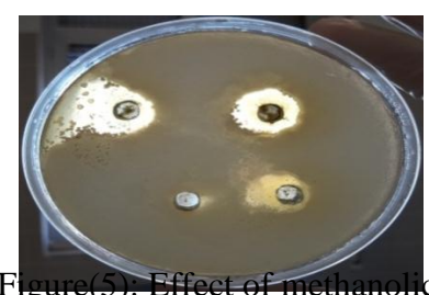
extraction of Chamomilla against .Pusedo